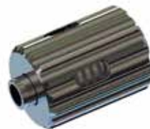
SmartDrive OL SFS 100

SmartDrive finger driver with 8 - 10 Ncm of Torque for safe and comfortable handling.